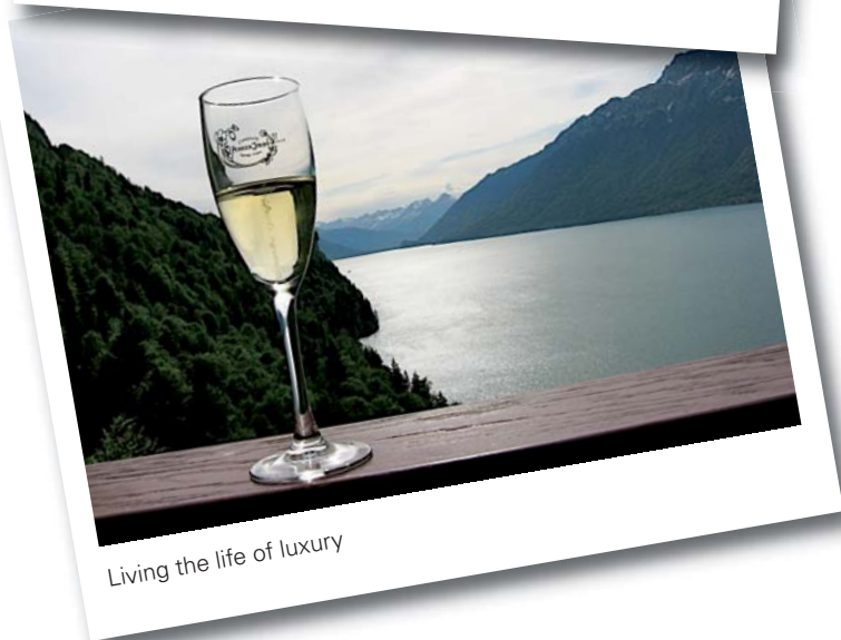
Living the life of luxury

For some people, checking into one of Switzerland's exclusive palatial hotels, for a weekend of indulgence, is the perfect way to forget the cares of the world. For Swiss News' Chantal Panozzo, it's a recipe for a panic attack.