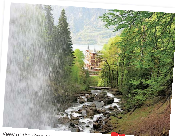
View of the Grand Hotel Giessbach from the waterfall

So, when Brian released me from his embrace, I walked over to pick up the shoeshine kit. I was wearing a pair of old canvas shoes; however, I felt a rush anyhow as I picked up the shoe polish, turning the container over in my hands, just thinking about the possibilities for future indulgence.