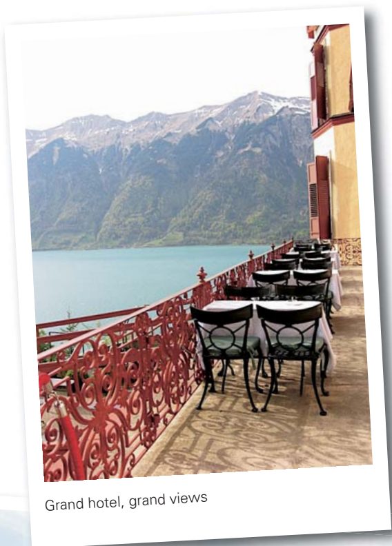
Grand hotel, grand views